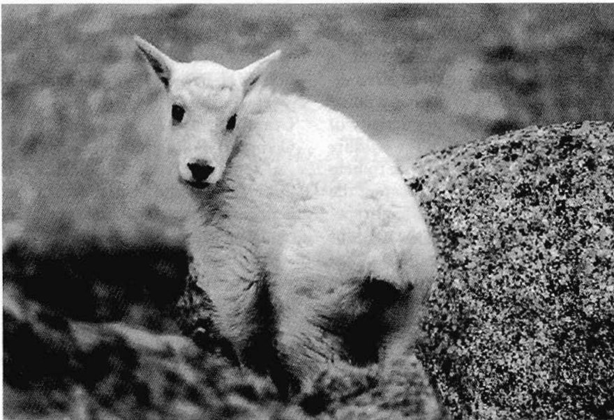
Sometimes the "cuteness" of juvenile wildlife prompts people to want to rescue/kidnap them. This young Mountain Goat does not need rescue.

may interfere with her ability to pinpoint the young's vocalizations). Consider the situation and whether anything happened to interfere with the reunion attempt. For example, if the neighbor lets his barking dog out on one side of the fence just as the mother is attempting to retrieve her young on the other side, the reunion may well be aborted.